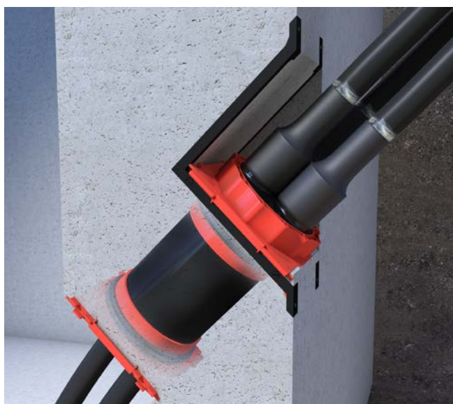
HSI 150-K2 S45°/X slanted wall insert and HSI 150-D3/58 system cover

Hauff-Technik provides different solutions for cable and earthing entries here – they are always recognisable by the three 3-ribbed seals made of TPE (thermoplastic elastomer).