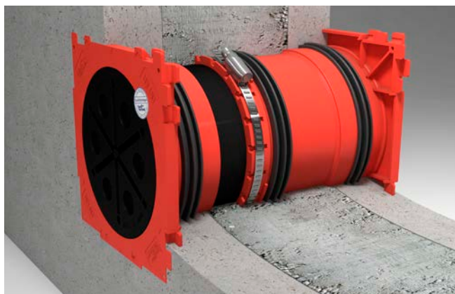
Infinitely adjustable to the required wall thickness. Cable entry HSI 150-K2-Varia for element walls.