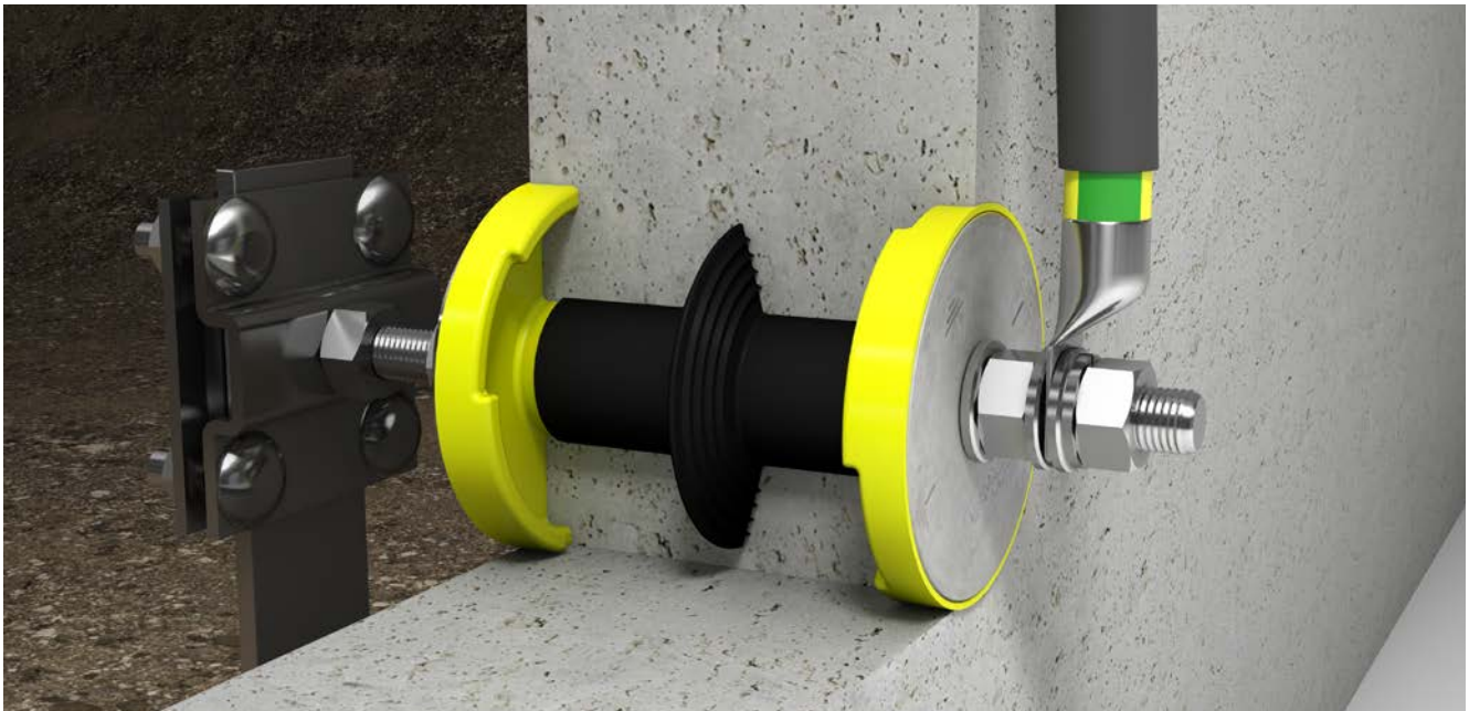
HEA-IS-M 12 earthing entry: a flat steel connection via the Z-KG-M 12 cross-clamp on one side and an earthing conductor connection via the Z-B-M 12 connection bolt on the other side.