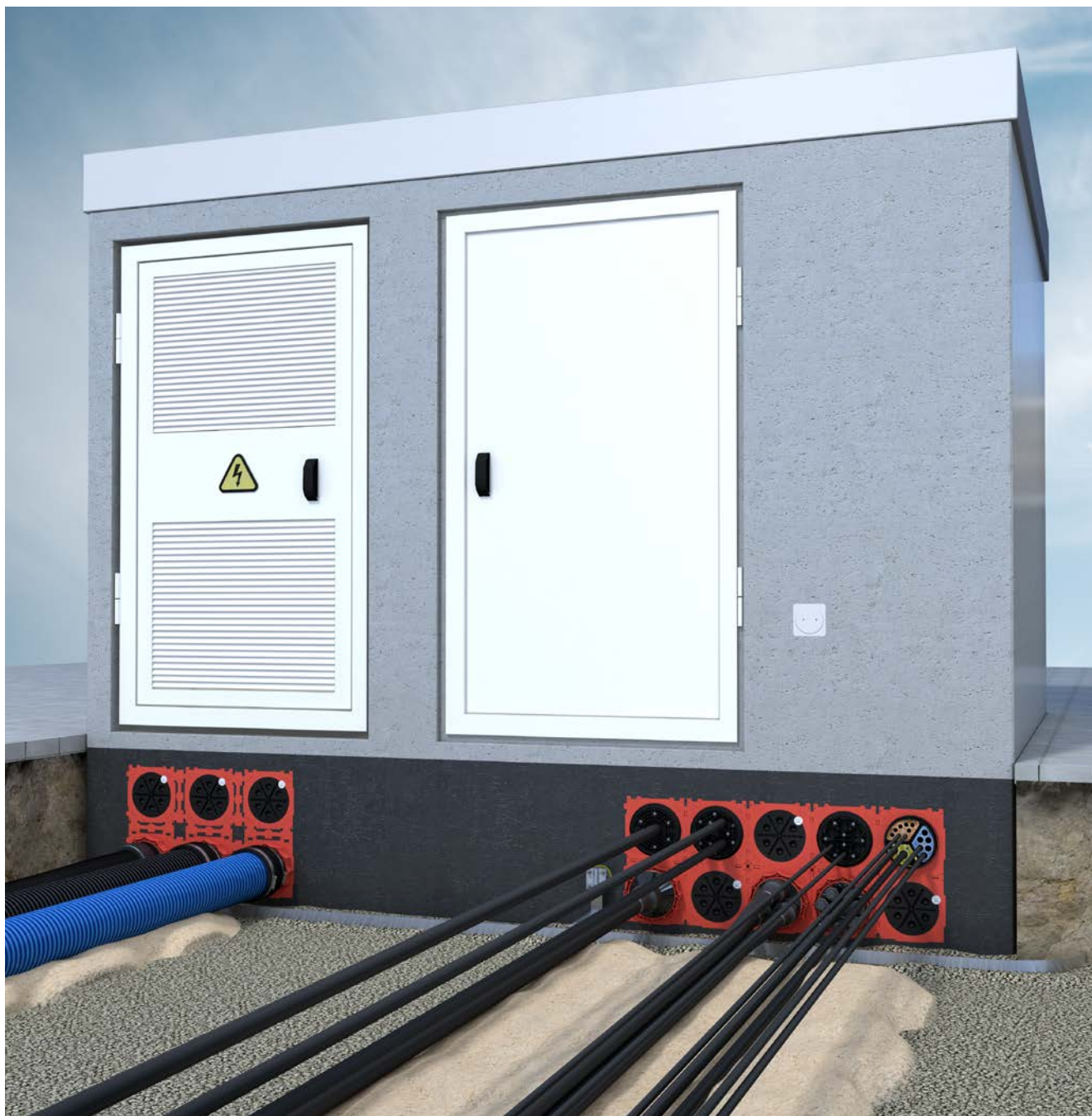
Different solutions for sealing cables and connecting protective pipes in walk-in secondary substations.

Walk-in secondary substations have the advantage that the system can be operated and maintained from within the building and is therefore not dependent on the weather. There are numerous installation possibilities for walk-in substation buildings. As a result, transformers, switch gears, inverters, registers and measuring devices can be integrated. Substations are generally installed above ground, but can also be built into slopes or installed underground depending on the requirements.