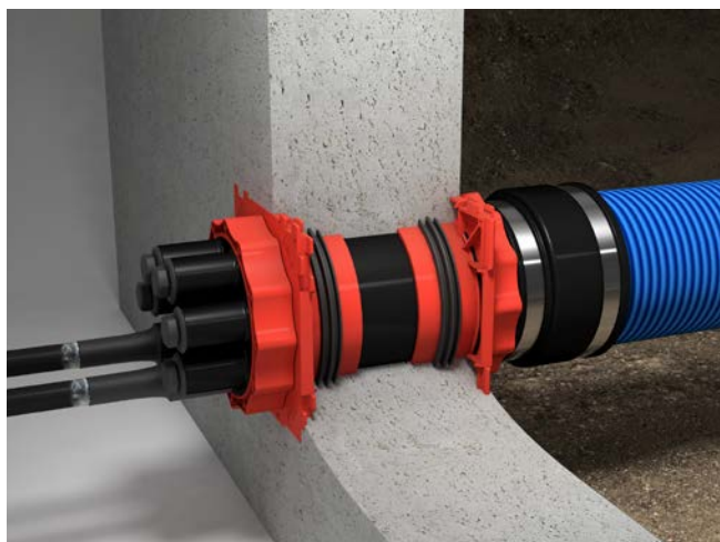
HSI 150-K2/X double wall insert, HSI 150-D7/33 system cover, KES-M 150-D pipe connection with sleeve and spiral hose 14150

The flexible and mechanically stable spiral hose 14150 with a smooth inner surface, in conjunction with the KES-M 150 connection components, is ideally suited to the construction of duct systems under the base plate.