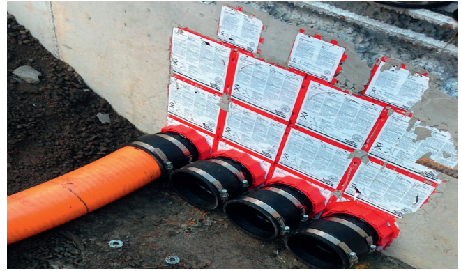
Connection of Hateflex spiral hose using KES 150-D system cover