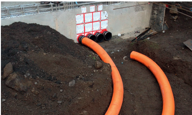
Hateflex spiral hose 5.3 m lengths