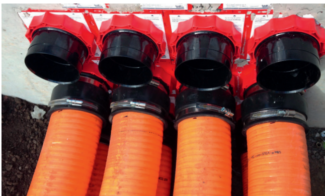
Connection of Hateflex spiral hose using KES 150-D system cover