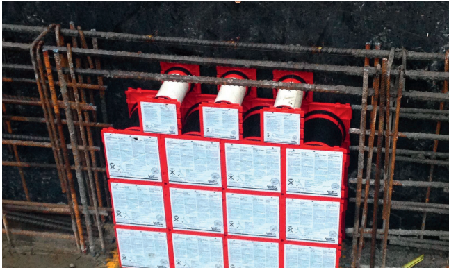
HSI 150-K2 and HSI 90-K2 wall inserts mounted in formwork