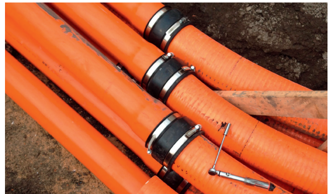
Connection sleeves between rigid and Hateflex spiral hose